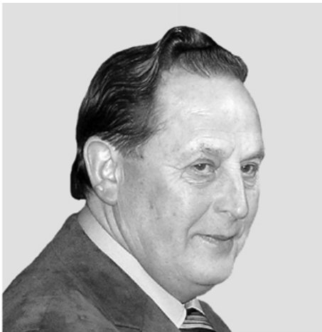
Design: Oddmund Vad

Convair was inspired by the observation of the multiple circles contained in a paper roll. These lines emerge from nature like the veins in the trunk of the trees.